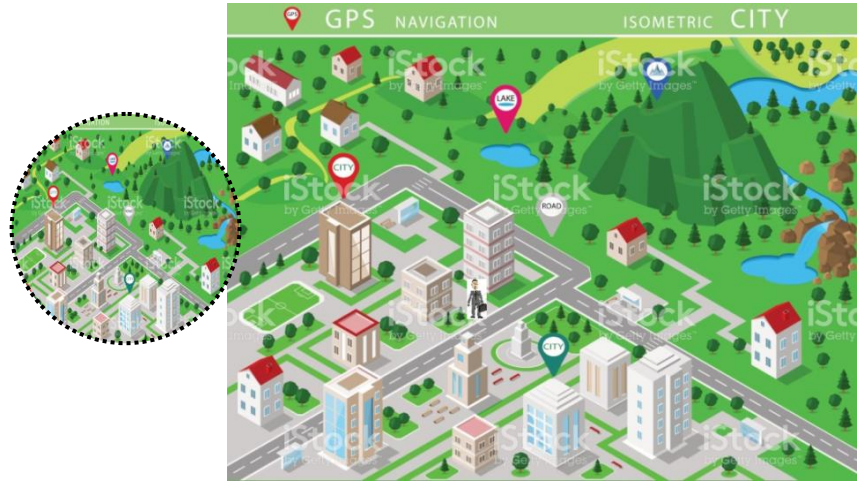
Fig. 1: Example of spatial range query

Spatial range query is a widely used LBS, which allows a user to find points of interest (POIs) within a given distance to his/her location. As illustrated in Fig. 1, with this kind of LBS, a user could obtain the records of all restaurants within walking distance (say 500 m). Then, the user can go through these records to find a desirable restaurant considering price and reviews.